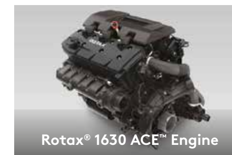
Rotax® 1630 ACE™ Engine

Large front storage area that's easily accessible from a seated position. 1