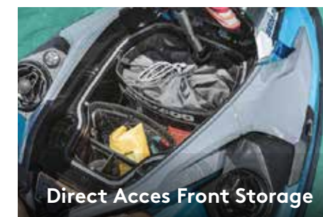
Direct Access Front Storage

An innovative hull that sets the benchmark for rough water handling, stability, and offshore performance.